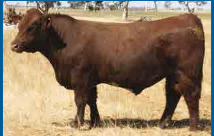
Lot 13 Belmore Rawhide U214