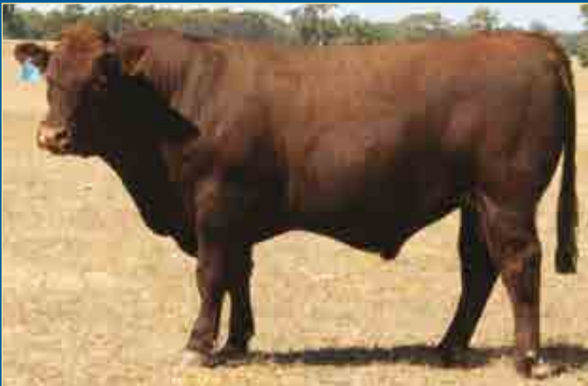
Lot 1 Belmore Fortress U55