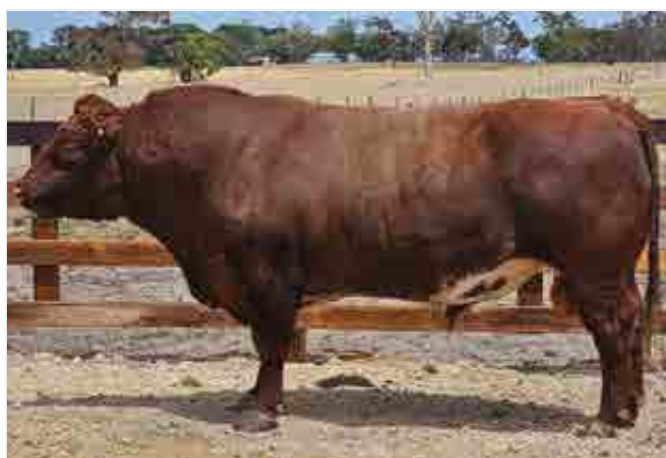
Yamburgan Tiger Moth Q196