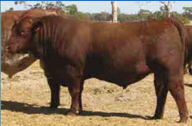
Lot 10 Belmore Wrangler U14