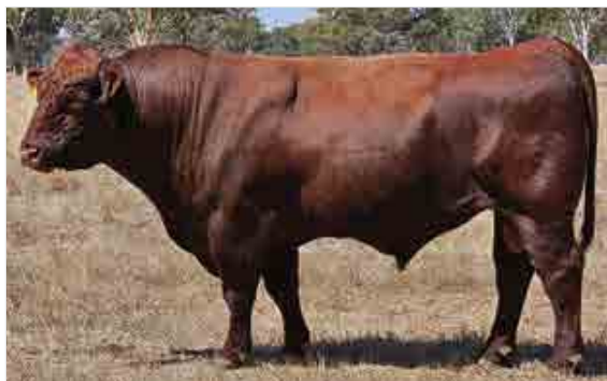
Polldale Rawhide R119