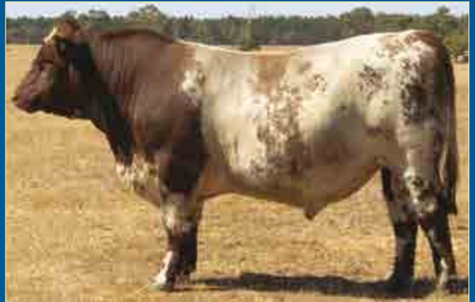
Lot 5 Belmore Tiger Moth U60