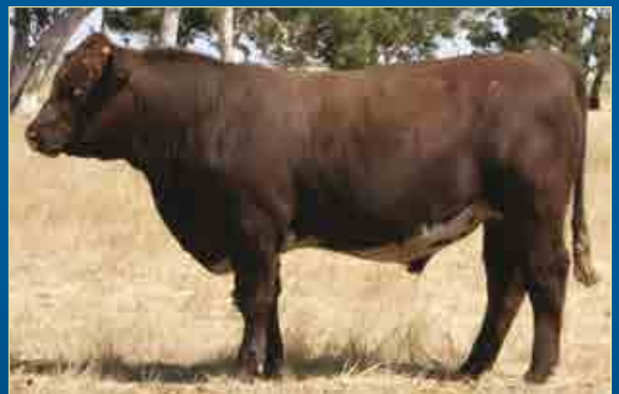
Lot 17 Belmore Infinity U177