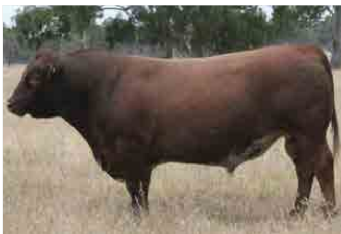
Yamburgan Tiger Moth Q172