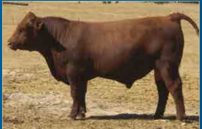
Lot 21 Belmore De Havilland U98