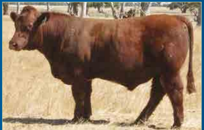
Lot 31 Belmore Rawhide U242