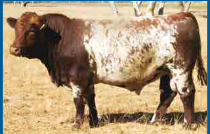
Lot 11 Belmore Zeus U133