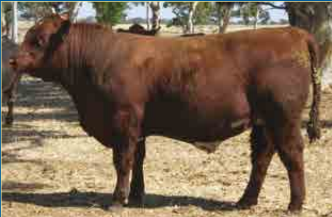
Lot 12 Belmore Rawhide U163