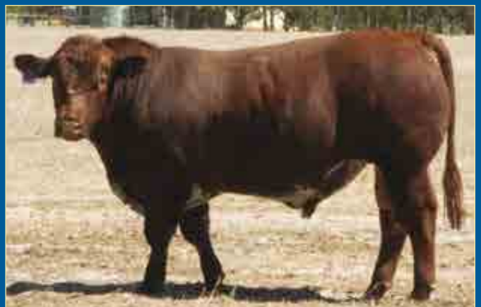
Lot 9 Belmore Tiger Moth U84