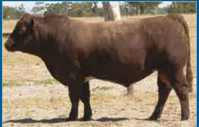
Lot 7 Belmore Blotched U50