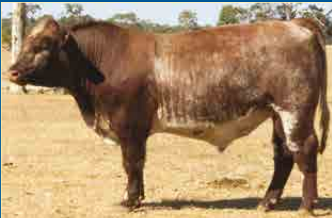
Lot 6 Belmore Blotched U40