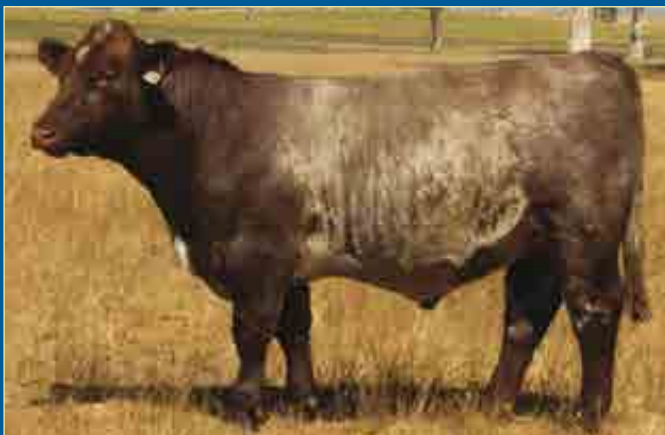
Lot 30 Belmore Rawhide U240