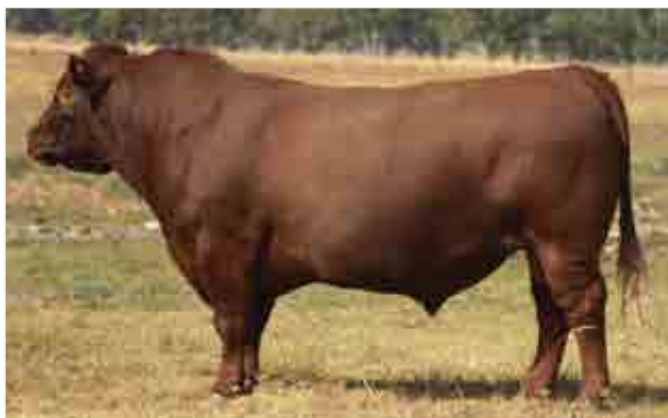
Belmore Cowboy Q303