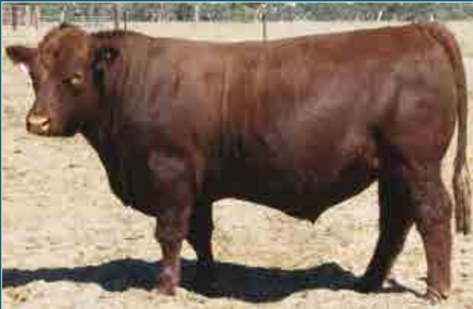
Lot 4 Belmore Wrangler U33