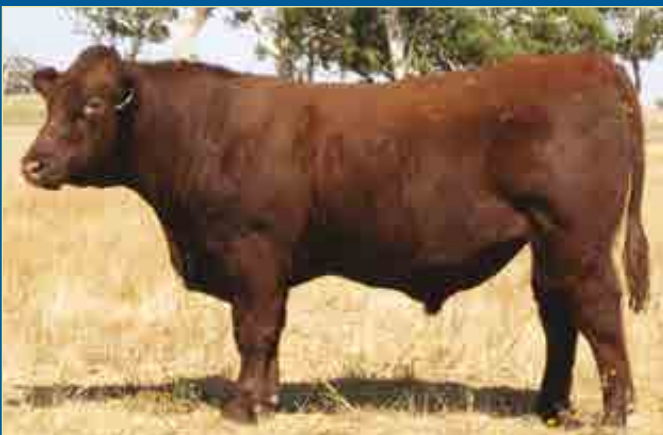
Lot 14 Meraki Rawhide U255