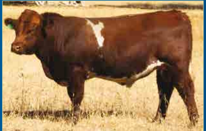
Lot 28 Belmore Tremain U231