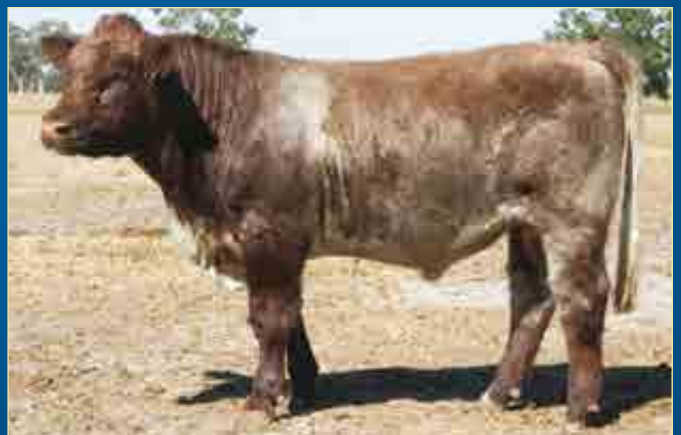
Lot 34 Belmore Infinity U230