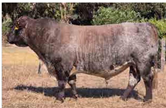
The Grove Infinity R0765