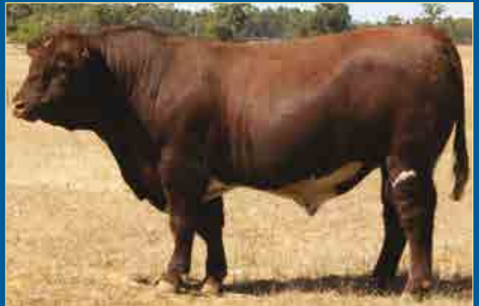
Lot 2 Belmore Fortress U65