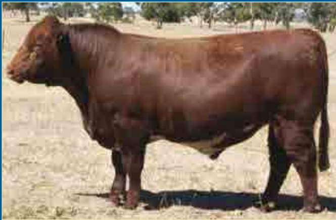
Lot 18 Belmore Rawhide U194