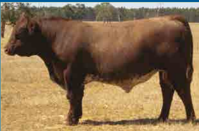
Lot 8 Belmore Tiger Moth U77