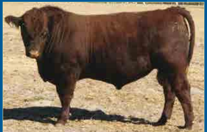
Lot 15 Belmore Infinity U216