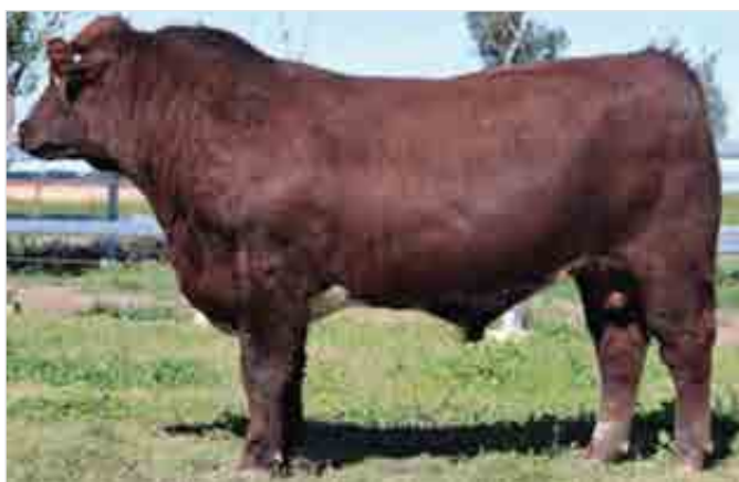
The Grove Blotched Q0595