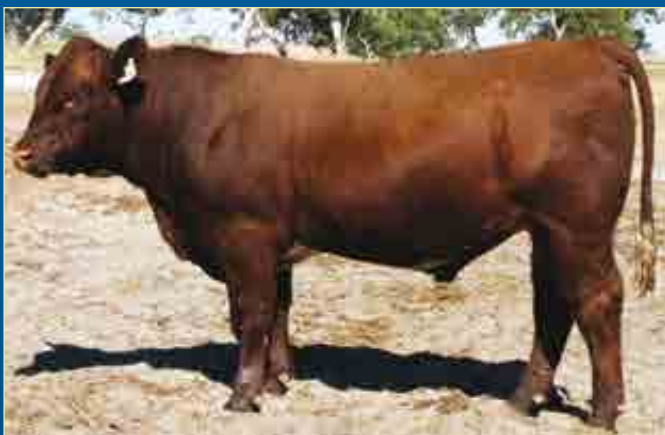
Lot 32 Belmore Zeus U137