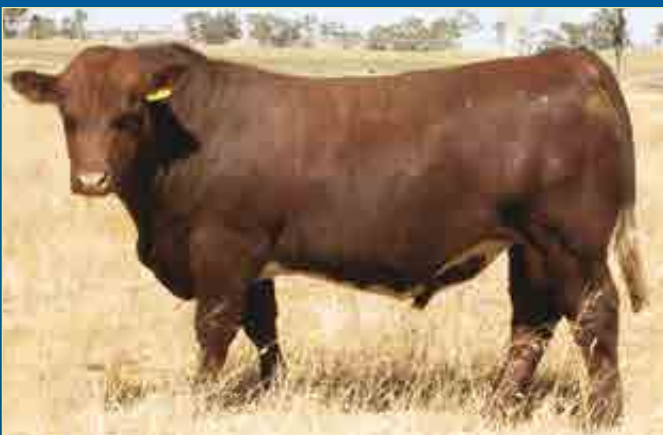
Lot 16 Belmore Playstation U210