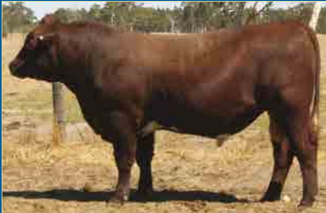
Lot 23 Belmore Blotched U58